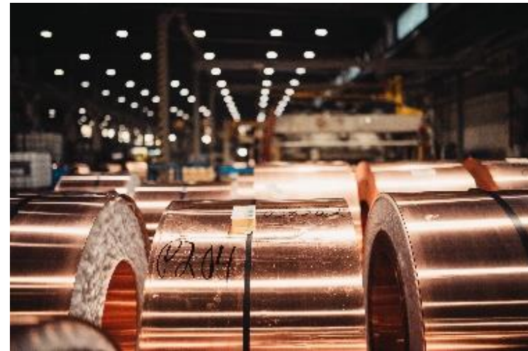
Copper rolls before cutting.